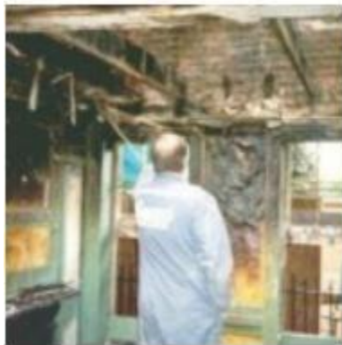
Fullers Brewery, London UK - Testing the original anchors after the fire

Cintec™ Anchors were later, unintentionally, put to the test at the Fullers Brewery in London. The Cintec™ anchor system had been used extensively to repair and restore the Brewery's facade. A fierce fire followed, destroying large sections of the building. Despite the brickwork being subjected to extremely high temperatures, tests revealed that the cementitious Cintec™ anchors did not fail, performing to their original design. They retained their integrity and could be reused for the repair work. If the anchors were an epoxy or resin type, they would have melted, releasing potentially dangerous fumes in the process and have been easily pulled out, allowing the wall to collapse. One could say that the Cintec™ Anchors having survived the fire are in fact fire proof.