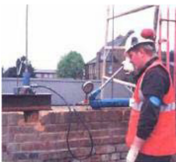
Post-tensioning Cintec anchor in test panel.

An insitu load test was carried out in order to demonstrate the applicability of Cintec anchors for both stabilising these structures and for strengthening them against dynamic air pressure loading. The test was also used to confirm that the performance of the strengthened wall had been correctly calculated and thus provide assurance of the methodology.