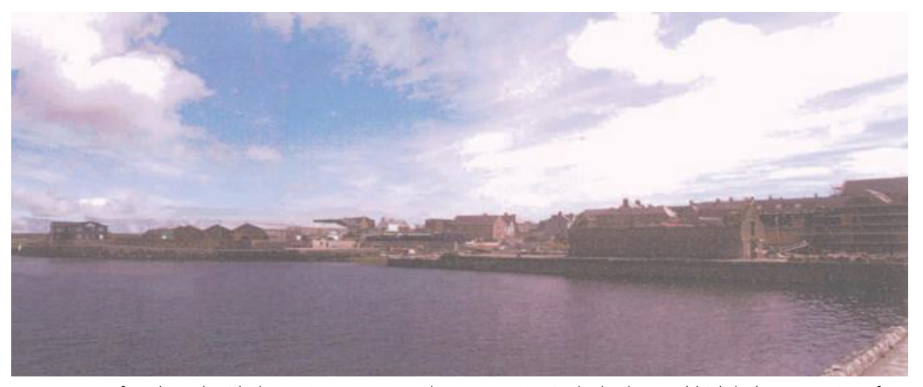
Panorama of Hay's Dock with the Heritage Centre under construction in the background (right), the restoration of the old sail house on the quay (centre right) and Cintec stabilisation work (end of the quay left of sail house).

Lerwick is the capital of the Sheltland Islands and in the early 1830's became a thriving centre for the herring industry. The foundation for this commercial success lay with the construction of Hay's Dock and a complex of warehouses and curing yards together with all the facilities for building and rigging sailing vessels. The fortunes of the herring industry fluctuated considerably during the 19th century and as vessels became larger and steam power became the norm, a new larger facility was required and subsequently built by the Lerwick Harbor Trust in 1906. The original dock continued to play an important commercial role adapting primarily to the timber trade.