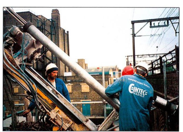
The assembling and installation of a compression anchor

A system was required to secure the gallows to the bridge arches; in their preliminary planning, Railtrack anticipated a shut down of the tracks for 6 weeks. Such a closure would mean a chaotic time table, irate passengers and a loss of revenue. The CINTEC Anchoring System proposal provided a solution that would require only 2 days of rail shut down.