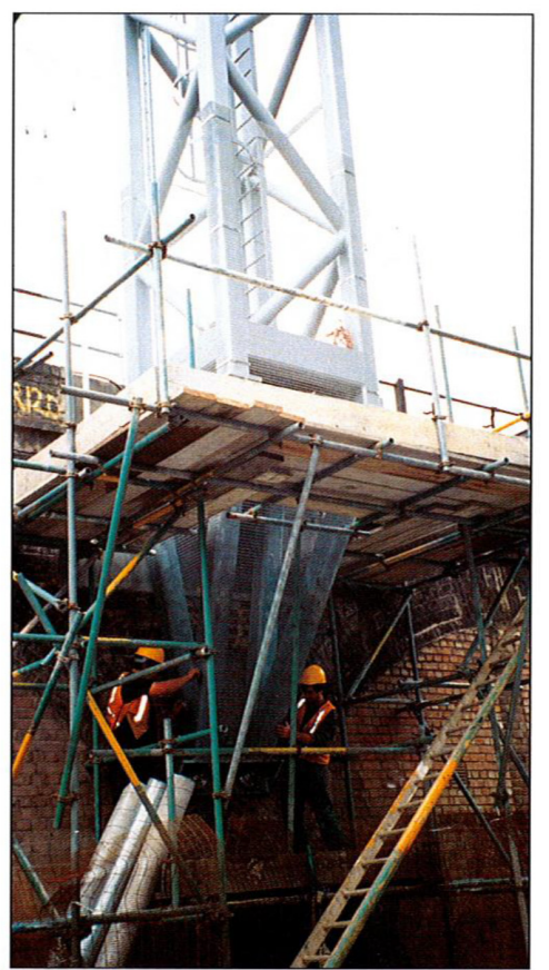
The torqueing of the anchors