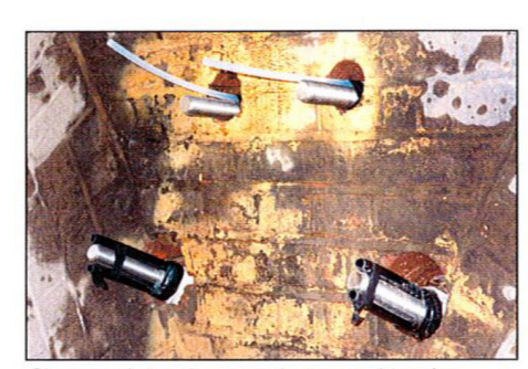
Shear anchors shown at the top and tension anchors at the bottom

FOUNDATION DETAILS OF ANCHOR ARRANGEMENT TO SIGNAL CANTILEVER FOR BRITISH RAILWAYS AT FENCHURCH STREET STATION LONDON