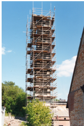
Chimney Restoration In Progress

“ Over a year ago, when we first addressed the restoration and stabilisation of the chimney, we could not have foreseen the level of effort and commitment required to complete this task. However, the success achieved over these last few months has clearly demonstrated that the product was well worth the effort.”