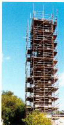
Chimney Restoration In Progress

“Over a year ago, when we first addressed the restoration and stabilisation of the chimney, we could not have foreseen the level of effort and commitment required to complete this task. However, the success achieved over these last few months has clearly demonstrated that the product was well worth the effort.”