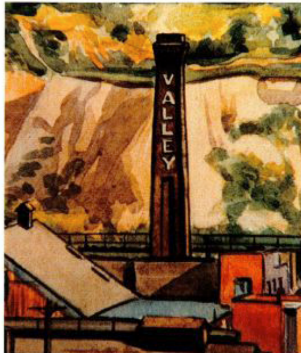
Don Valley Brickworks Contemporary Illustration

The Chimney, built in about 1890, had serviced three adjacent downdraft kilns. The shaft had been deteriorating through the years and had become a pigeon roost! Significant cracking appeared on the east and west elevations and it was found to be leaning almost 43 inches (1.09m) to the south and a bit to the west. The corrective action was to stitch two sides together using the Cintec Anchoring System. The Cintec Canada Company had had previous experience in similar projects obtaining excellent results in what is truly corrective surgery on buildings. The restoration work also included substantial repointing and some brick replacement.