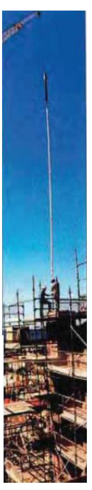
20 m vertical anchor being placed by crane in the project which saw anchors up to 32 m horizontally, Cintec's longest to date.