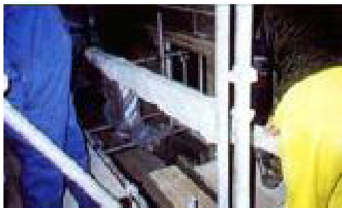
Insitu assembly of 100x100 mm stainless steel 10m anchor