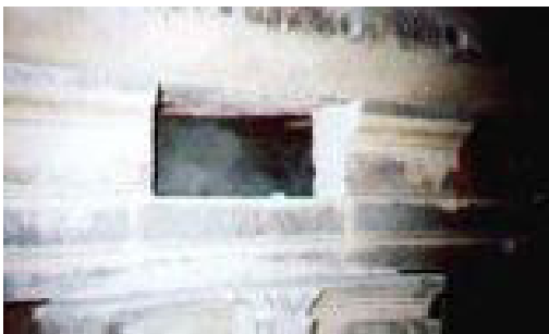
Openings cut in masonry to expose defective wooden beam prior to its removal