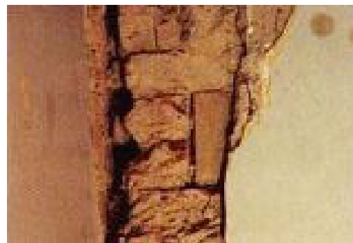
Internal damage of wooden beam