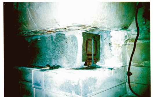
Beam after grout injection