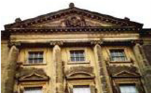
External upper beam area