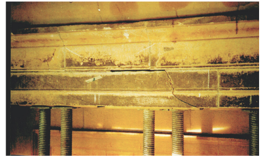
First sign of distressed beam

An inspection during the course of repairs revealed that one of the original timber beams in the area of the Tympanum had seriously decayed. This beam acted as a support for the upper stonework and a hanger for the lower stones. With this decay the lower stones had cracked and showed signs of falling out.