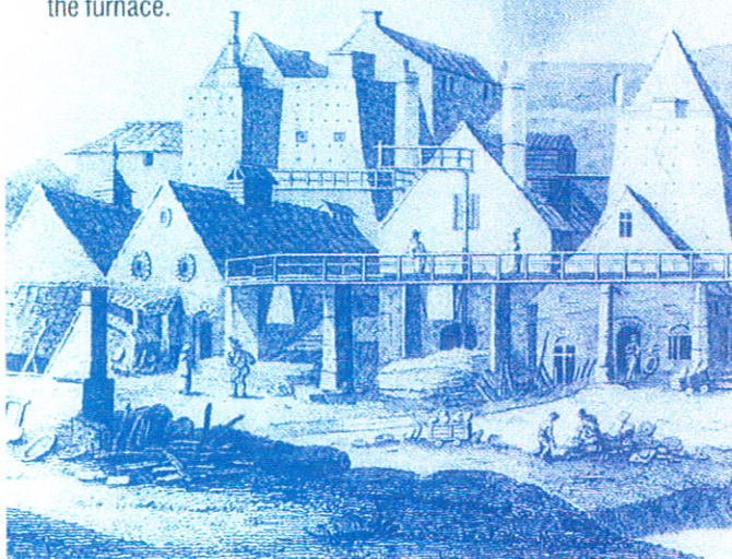
Drawing by Sir Richard Colt Hoare from Cox's Tour in Monmouthshire 1799