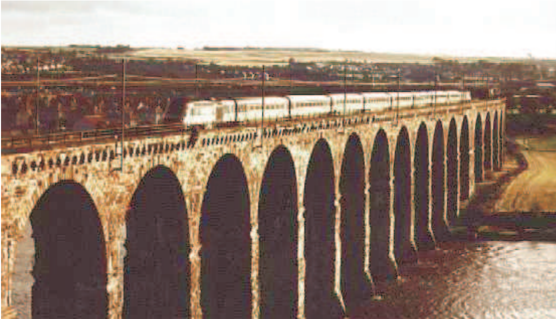
Royal Border Bridge, carrying London-Edinburgh mainline train.

As part of Railtrack's major programme of repair and refurbishment of the land-based arches, work was authorised on numbers 1-15 of the Royal Border Railway Bridge. The bridge carries the main Inter-City East Coast rail line between Edinburgh (Waverley Street) and London (King's Cross). George Stephenson's magnificent 28-arch, 128 feet high viaduct spans the tidal estuary of the River Tweed between Berwick and Tweedmouth, two and a half miles south of the Anglo-Scottish border. Queen Victoria and Prince Albert opened the 2160 feet long bridge in 1850; the structure will celebrate its 150th Anniversary at the Millennium. The project was complicated by both environmental and technical factors.