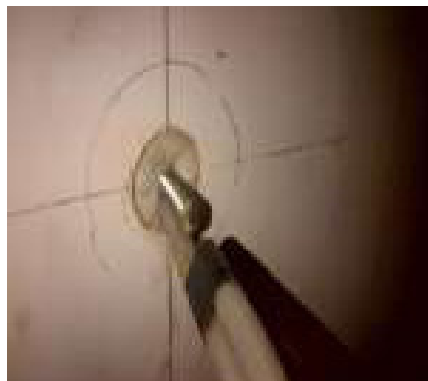
Installed anchor in the wall