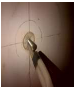
The picture show the installed anchor in the wall